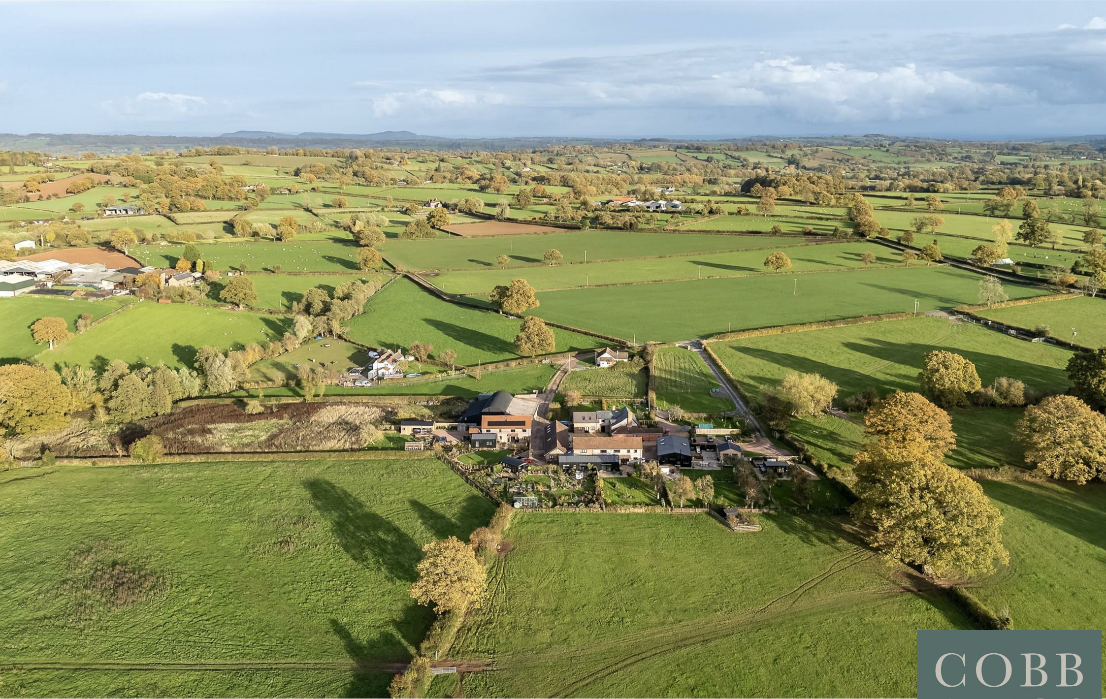
The Cart House, 4 Meadow Bank, Hatfield, HR6 0SG Price £575,000